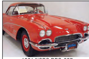
1961 NCRS RPO-687