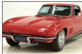
1967 Benchmark 350hp AIR