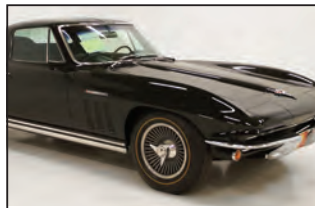
1965 Duntov Fuelie Tanker