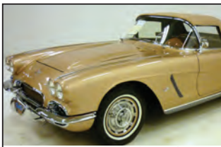
1962 GM Styling Show Car