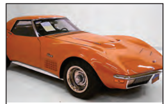
1971 Bloomington & NCRS ZR2