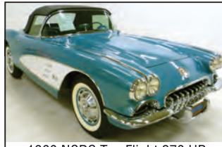
1960 NCRS Top Flight 270 HP