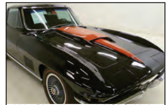
1967 Bloomington & NCRS 435hp