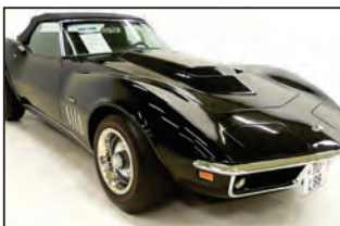
1969 Triple Crown L88