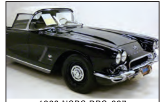
1962 NCRS RPO-687