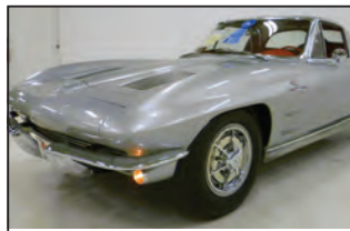
1963 NCRS Z06 Tanker