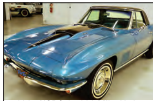
1967 NCRS 15,000 Mile 435hp