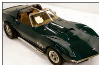
1969 Motion Phase III