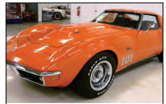
1969 NCRS L88