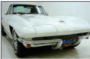
1964 Factory Air & NCRS