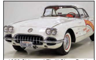
1958 Chitwood Thrill Show Fuelie