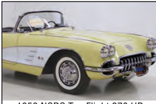
1959 NCRS Top Flight 270 HP