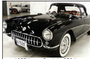
1957 Laser Straight 270 hp