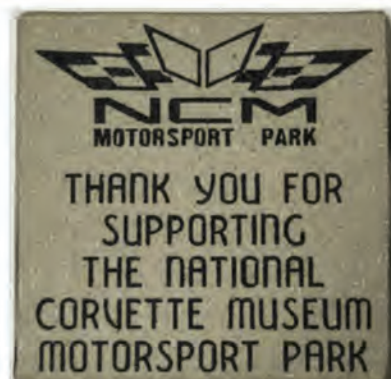
Medium Brick Sample