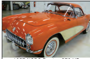
1957 NCRS Duntov 270 HP