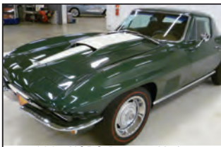
1967 NCRS Duntov 435hp