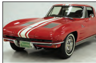
1963 Benchmark Z06 Fuelie