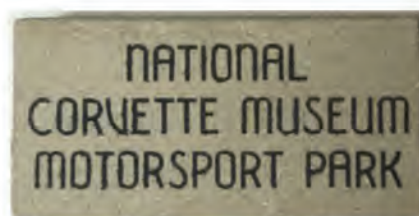
Small Brick Sample