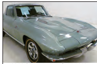
1966 Bloomington Gold 390hp