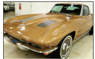
1963 Body-Off 340hp