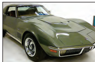
1971 Bloomington & NCRS ZR2