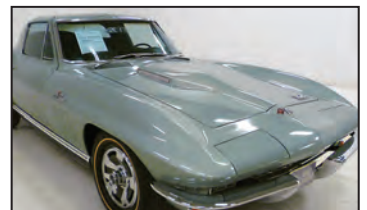
1966 Bloomington Gold 390hp