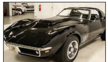
1969 2,000 Mile NCRS L88