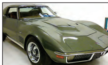
1971 Bloomington & NCRS ZR2