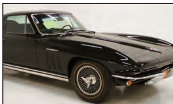
1965 Duntov Fuelie Tanker