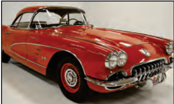
1960 RPO-687 Fuelie • NCRS