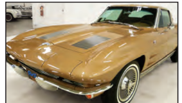
1963 NCRS 340hp