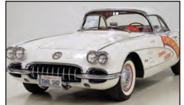
1958 Chitwood Thrill Show Fuelie