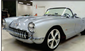
1957 510 HP Retro-Mod