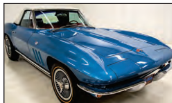
1965 Nassau Blue/Red COPO