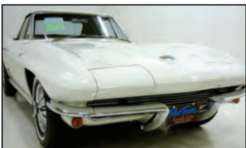
1964 Factory Air & NCRS