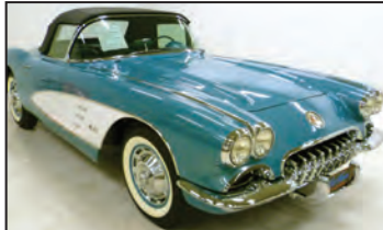
1960 NCRS Top Flight 270 HP