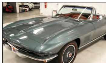
1967 Blue/Red NCRS COPO