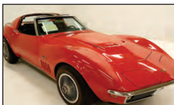
1969 22,000 Mile 435 hp