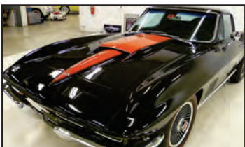
1967 Bloomington & NCRS 435hp