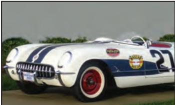
1953 NASCAR CORVETTE.com