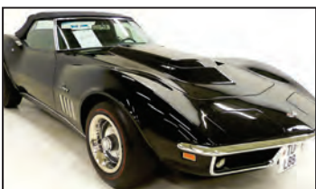
1969 Triple Crown L88