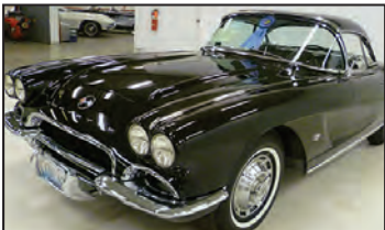
1962 "The Last C1 Corvette"