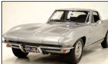
1963 NCRS Z06 Tanker