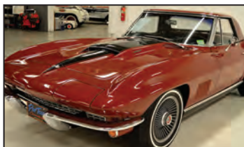
1967 Unrestored 435hp