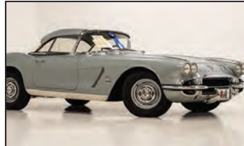
1962 NCRS RPO-687