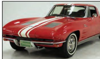
1963 Benchmark Z06 Fuelie