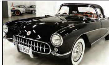
1957 Laser Straight 270 hp