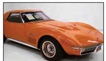
1971 Bloomington & NCRS ZR2