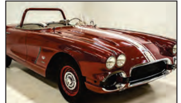
1962 SCCA Championship Car